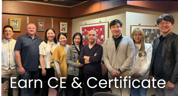
Live Patient Surgery