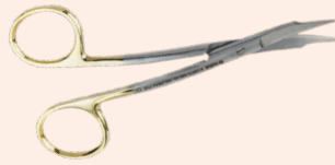
Goldenman Fox Scissors (1)