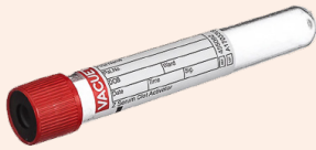
Red Tube (50)