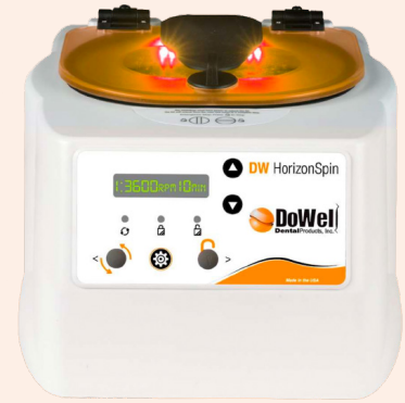
DW HorizonSpin (1)