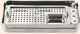
PRF-BOX R (1)